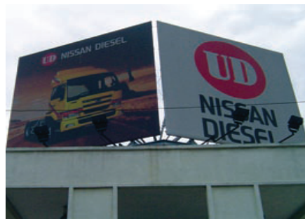
(Above) Ad board for TCIE. The largest manufacturer and distributor of Nissan Diesel Trucks and Buses in Malaysia